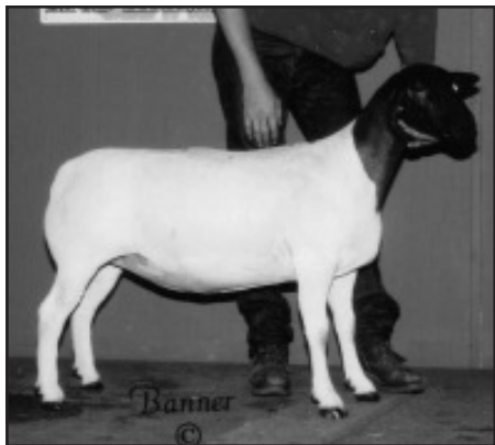
3rd Dorper Yearling Ewe at the '09 Midwest Stud Ram Sale sold from Ohio to Indiana for $4000.