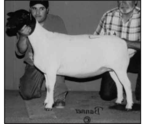
2nd Spring Dorper Yearling Ewe at the '09 Midwest Stud Ram Sale sold from Oregon to Texas for $1600.

Mail Bids & Delivery Call Assistance 573/442-8257 Available