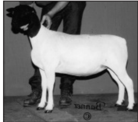
1st Fall Dorper Ewe Lamb at the '09 Midwest Stud Ram Sale sold from Ohio to Missouri at $750.

855-Purebred Yearling Ewe Shady Lawn 901 EP055573 B: 12/13/08 Tw S: Riverwood 4914 RF049635 D: Van Well Sheep Farm EP039485