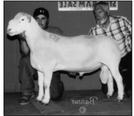
Reserve Champion White Dorper Yearling Ram at the '09 Midwest Stud Ram Sale sold from Oregon to Texas for $4000.