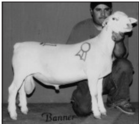
Grand Champion White Dorper Spring Ram Lamb at the '09 Midwest Stud Ram Sale sold from Oregon to Texas for $15000.