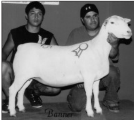
Grand Champion White Dorper Yearling Ewe at the '09 Midwest Stud Ram Sale sold from Oregon to Texas for $3750.