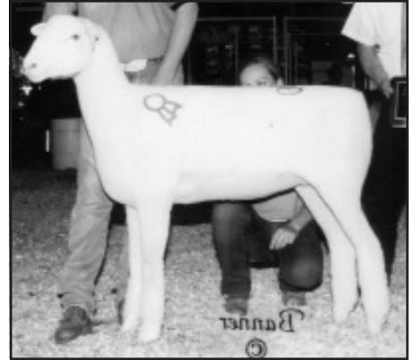
Grand Champion Polled Dorset Yearling Ewe at the '09 Midwest Stud Ram Sale sold from Ohio to Oklahoma for $4750.