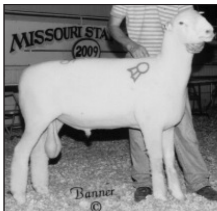
Grand Champion Polled Dorset September Ram Lamb at the '09 Midwest Stud Ram Sale sold from Ohio to Pennsylvania at $3200.

Bauck 7-03 is one of the top sons of "High Power". A real high volumed ewe.