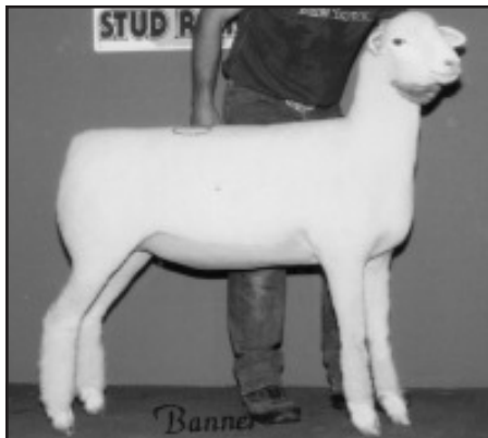
4th Polled Dorset September Ewe Lamb at the '09 Midwest Stud Ram Sale sold from Wisconsin to Illinois for $1500.