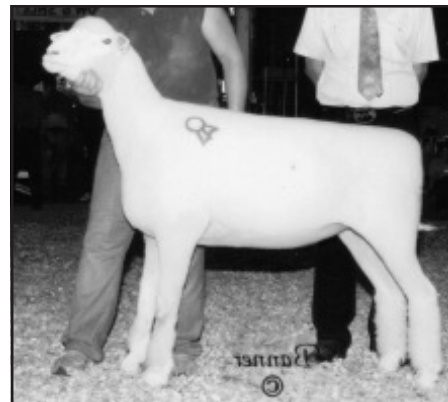
Reserve Champion Polled Dorset Yearling Ewe at the '09 Midwest Stud Ram Sale sold from Pennsylvania to Illinois at $1000.

V-50T was raised and shown last year. Dam S-12R, is out of RSF 506, Reserve Champion at the '08 OH Dorset Sale. S-12R has twin ewe lambs for us. We will bring one and keep the other.