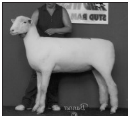
Polled Dorset Yearling Ewe at the '09 Midwest Stud Ram Sale sold from Missouri to Alabama for $350.

Substitute Entries Will Be Identified With a Line Under the Lot Number