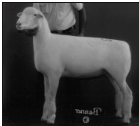
1st Polled Dorset Yearling Ewe at the '09 Midwest Stud Ram Sale sold from Pennsylvania to Ohio at $1800.