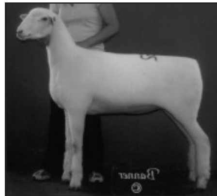
1st Polled Dorset September Ewe Lamb at the '09 Midwest Stud Ram Sale sold from Minnesota to Colorado for $1500.

B: 01/03/10 Tw S: Gibson 8013 S: "Bam" OK State 59 D: Gibson 615 D: Millers 703 S: Penn State 6151 D: Millers 3-11