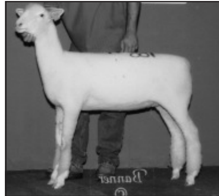
4th February Polled Dorset Ewe Lamb at the '09 Midwest Stud Ram Sale sold from Missouri to Ohio at $625.

B: 03/01/10 Tw S: Slack 8042 P673240 D: Gibson 8022 P670978