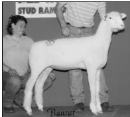
Junior Champion Polled Dorset February Ewe Lamb at the '09 Midwest Stud Ram Sale sold from Ohio to Illinois at $1650.

7432 was shown as a lamb and a yearling ewe. When we entered this lamb, we shuttered a bit! We should keep her, but if we bring her, she is worth more than a look.