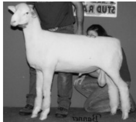
3rd Polled Dorset January Ram Lamb at the '09 Midwest Stud Ram Sale sold from Wisconsin to Illinois at $600.

Nice, complete ewe who's dam is a "Rumble" daughter.