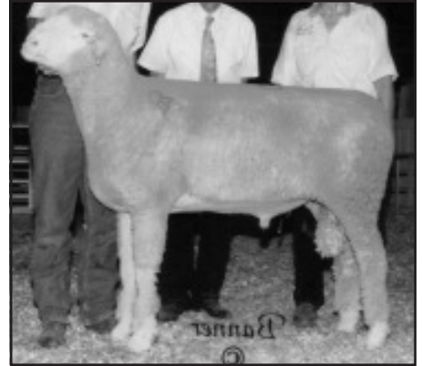
Reserve Champion Columbia Yearling Ram at the '09 Midwest Stud Ram Sale sold from Ohio to Utah.