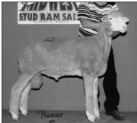
Grand Champion Columbia Ram Lamb at the '09 Midwest Stud Ram Sale sold from Michigan to Wisconsin.