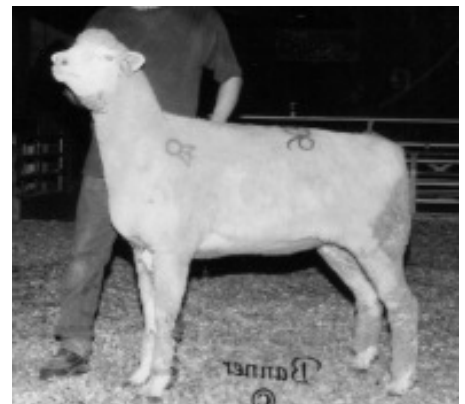
Reserve Champion Columbia Yearling Ewe at the '09 Midwest Stud Ram Sale sold from Illinois to Minnesota for $400.

We are keeping the twin sister within our flock. A stylish ewe lamb who will be a positive addition to any flock.