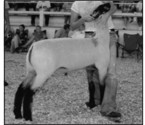
Reserve Champion Hampshire January Ram Lamb at the '09 Midwest Stud Ram Sale sold from Colorado to Iowa at $5,000.