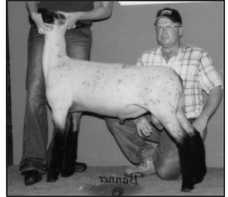
6th Hampshire March Ram Lamb at the '09 Midwest Stud Ram Sale sold from Illinois to Iowa at $7000.