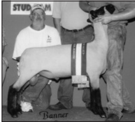
1st Hampshire February Ram Lamb at the '09 Midwest Stud Ram Sale sold from Wyoming to Minnesota for $10,000.