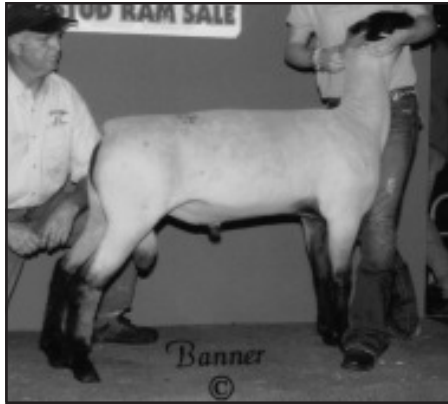
2nd Hampshire January Ram Lamb at the '09 Midwest Stud Ram Sale sold from California to Texas at $8000.