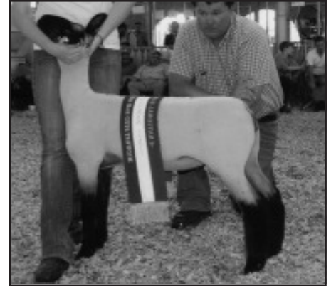
1st Hampshire March Ewe Lamb at the '09 Midwest Stud Ram Sale sold from South Dakota to North Carolina at $1100.