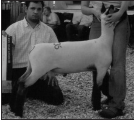
2nd Hampshire March Ram Lamb at the '09 Midwest Stud Ram Sale sold from Michigan to Indiana at $8000.