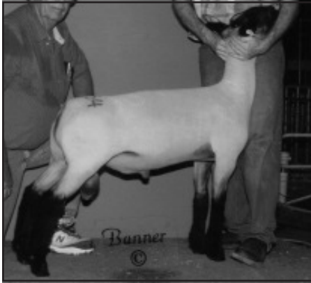
March Hampshire Ram Lamb at the '09 Midwest Stud Ram Sale sold from Texas to Iowa for $10,500.