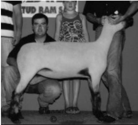
6th Hampshire Yearling Ewe at the '09 Midwest Stud Ram Sale sold from Texas to Iowa at $13,500.