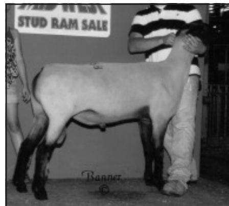
1st Hampshire Yearling Ram at the '09 Midwest Stud Ram Sale sold from Michigan to Iowa for $8400.