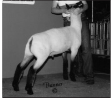
February Hampshire Ram Lamb at the '09 Midwest Stud Ram Sale sold from Colorado to Ohio for $1500.