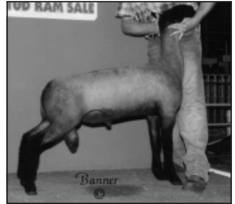
Reserve Champion Natural Colored January Ram Lamb at the '09 Midwest Stud Ram Sale sold from Illinois to Utah for $3900.