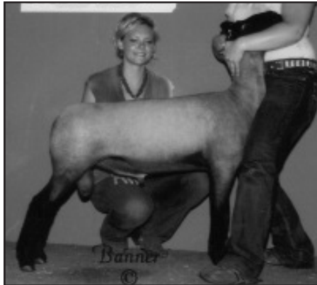
Grand Champion Natural Colored March Ram Lamb at the '09 Midwest Stud Ram Sale sold from Iowa sold at $4400.