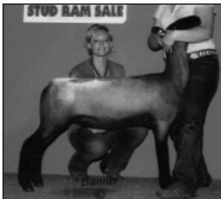
Grand Champion Natural Colored February Ewe Lamb at the '09 Midwest Stud Ram Sale sold from Iowa to Indiana at $1750.