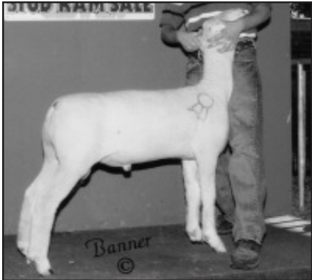
Grand Champion Dorset February Ram Lamb at the '09 Midwest Stud Ram Sale sold from Kansas to Indiana at $2200.