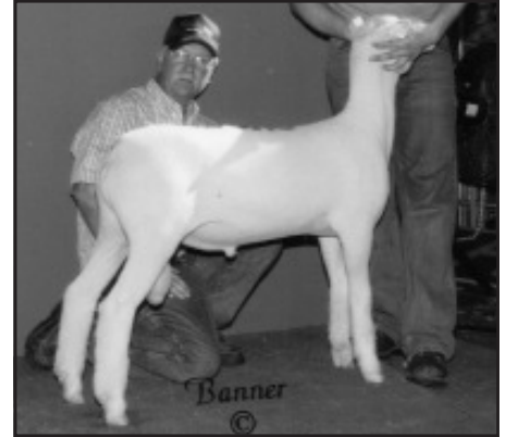
4th Polled Dorset January Ram Lamb at the '09 Midwest Stud Ram Sale sold from Indiana to Tennessee at $1000.