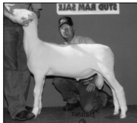
2nd Dorset January Ram Lamb at the '09 Midwest Stud Ram Sale sold from Indiana to California at $2150.