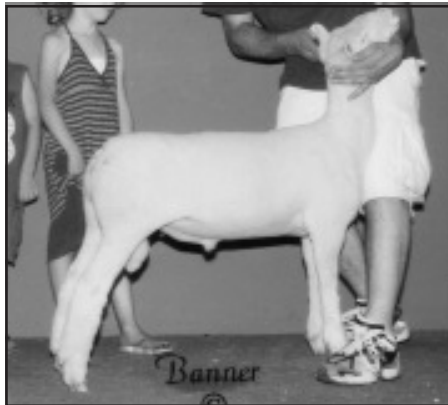
2nd March Ram Lamb Dorset Wether Sire at the '09 Midwest Stud Ram Sale stayed in Iowa at $3100.