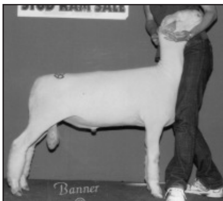
1st Dorset January Ram Lamb at the '09 Midwest Stud Ram Sale sold from Colorado to Texas at $1150.