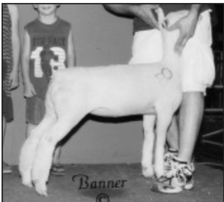
Reserve Champion Dorset March Ewe Lamb at the '09 Midwest Stud Ram Sale sold from Iowa to Oklahoma at $2250.