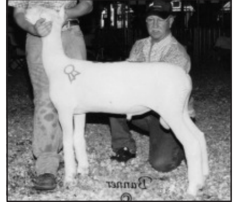
Reserve Champion Dorset Ram Lamb at the '09 Midwest Stud Ram Sale sold from Indiana to South Dakota at $1100.